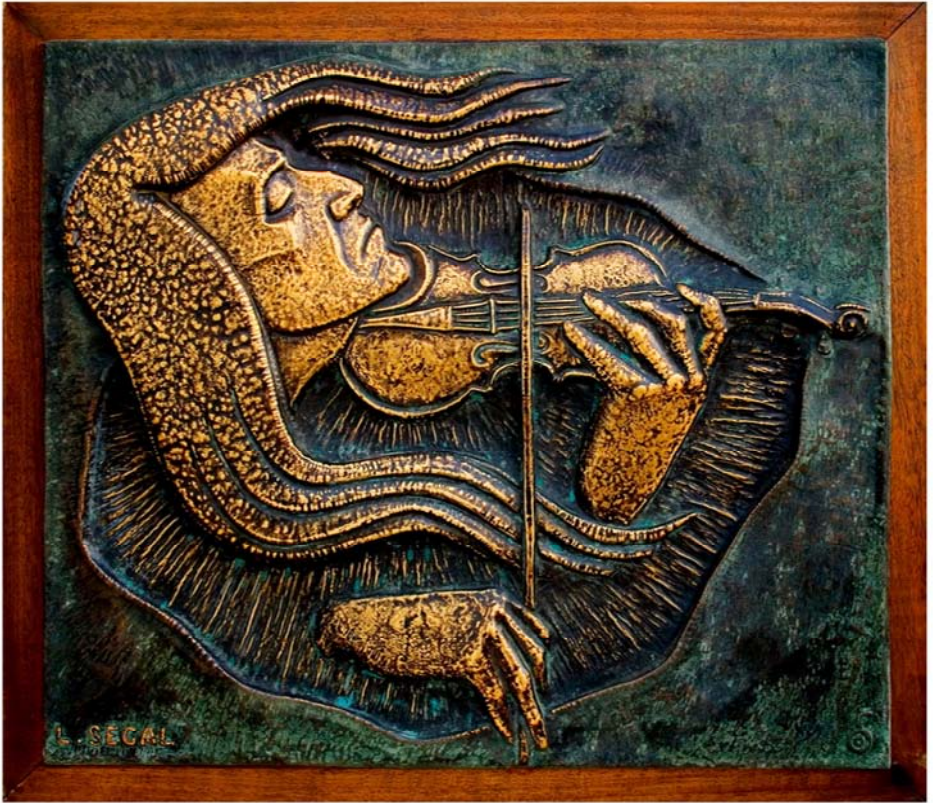
30. Paganini (65x75 cm)