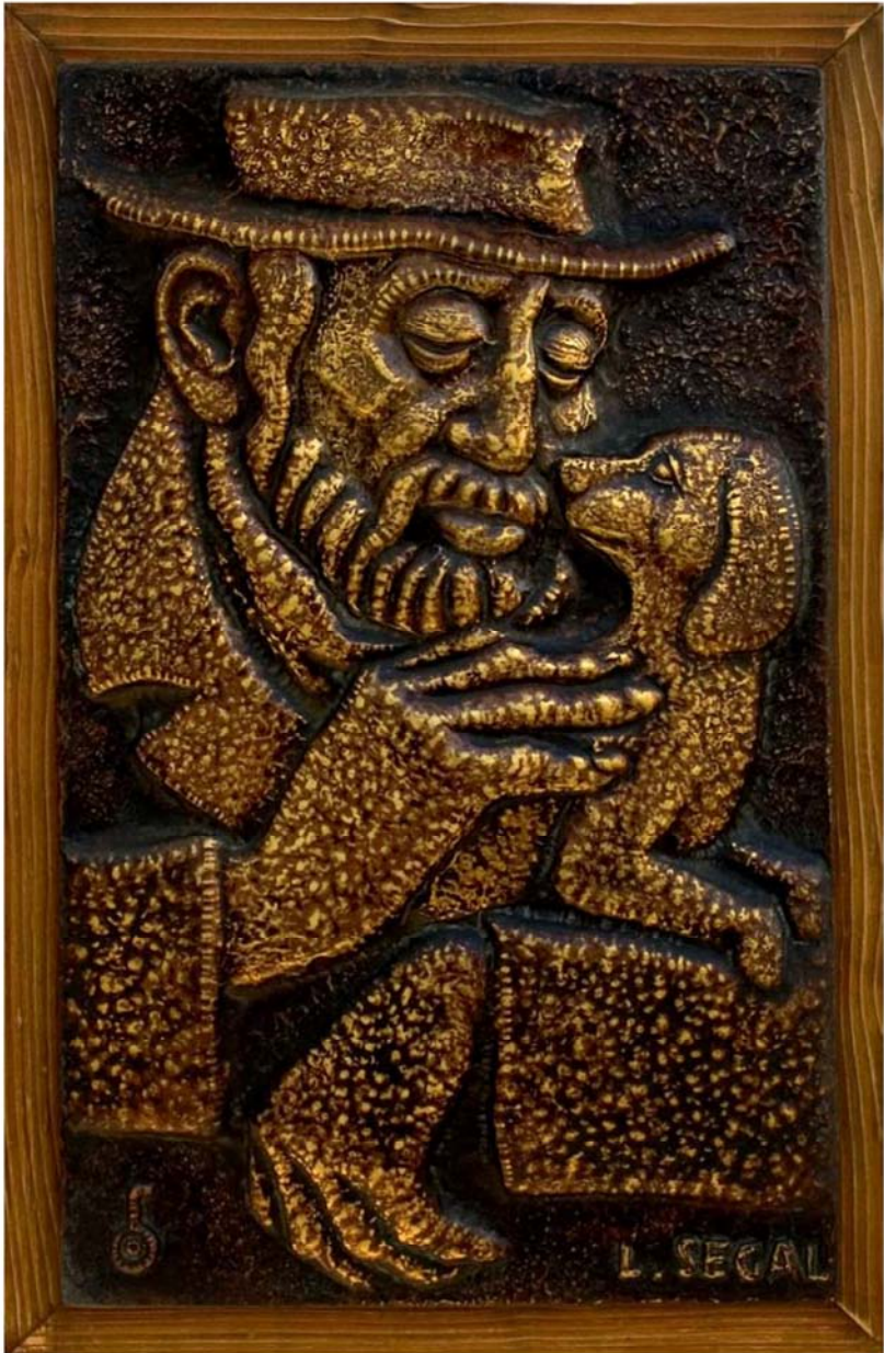
18. Friends (65x38 cm)