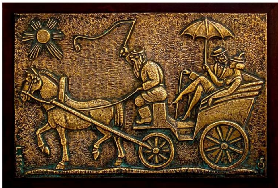
15. Meeting (45x66 cm)