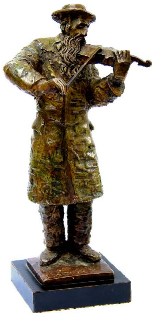
6. Violinist (37 cm)