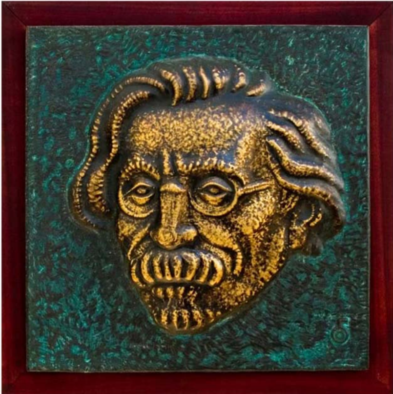
1. Shalom Alechem (42x42 cm)