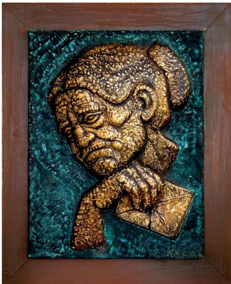
19. Letter from son (50x42 cm)