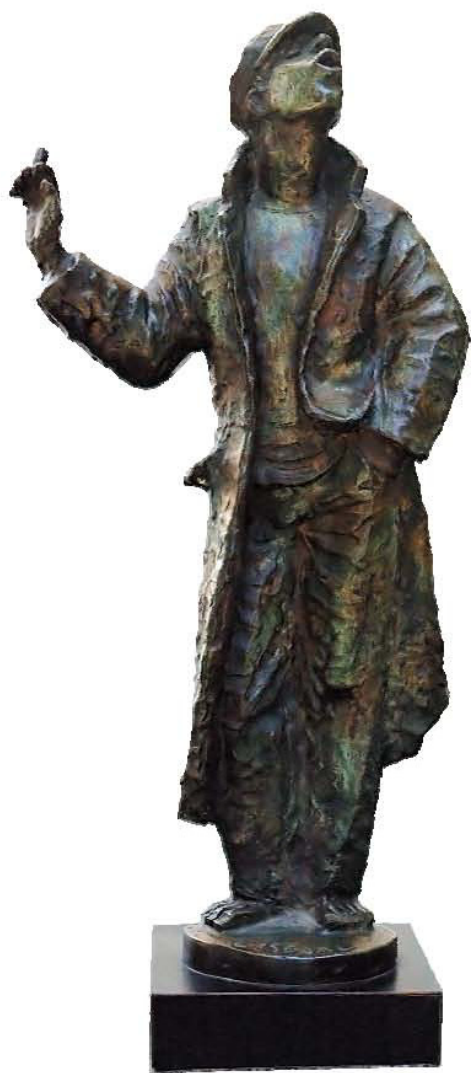
10. Mottele (38 cm)