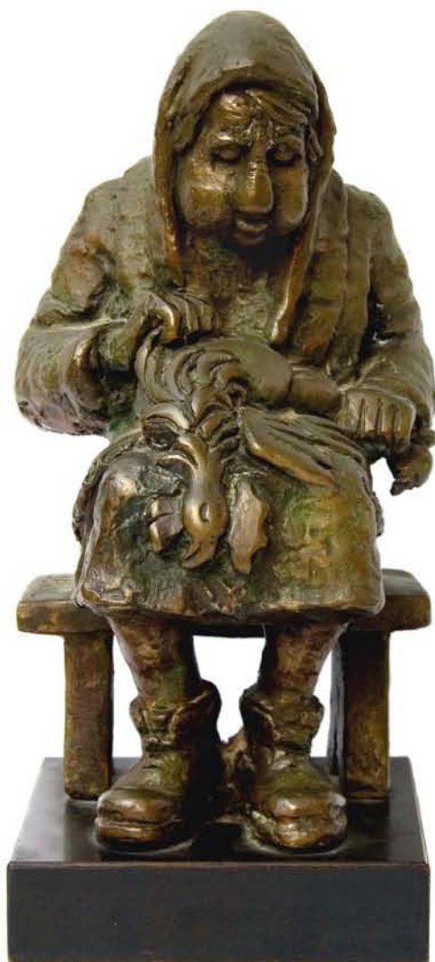
23. Grandmother (27 cm)