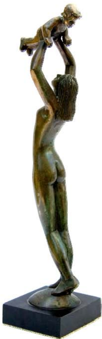
13. Mother (46 cm)