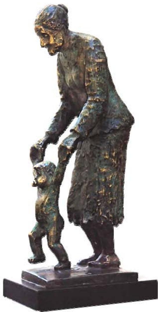
15. First steps (38 cm)