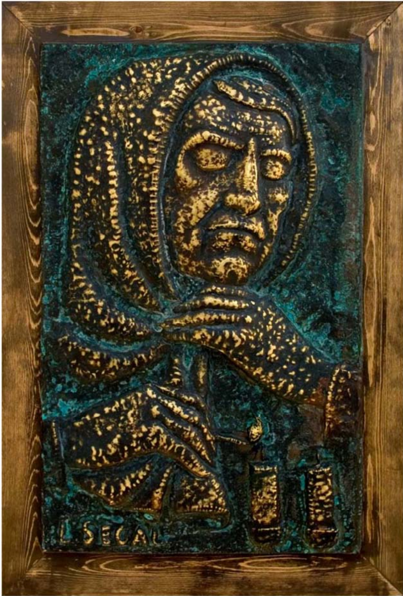
10. Shabbat candles (58x38 cm)