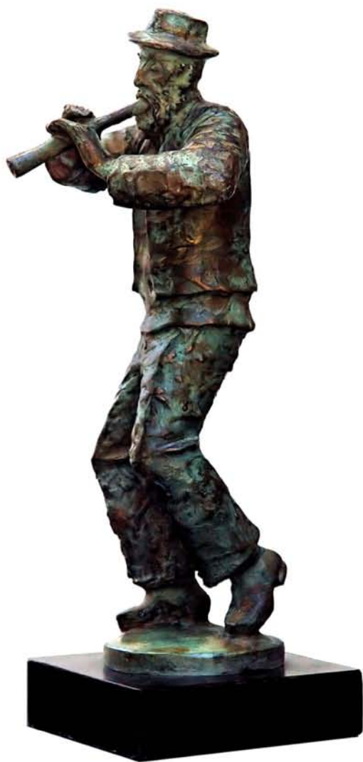
27. Musician (37 cm)