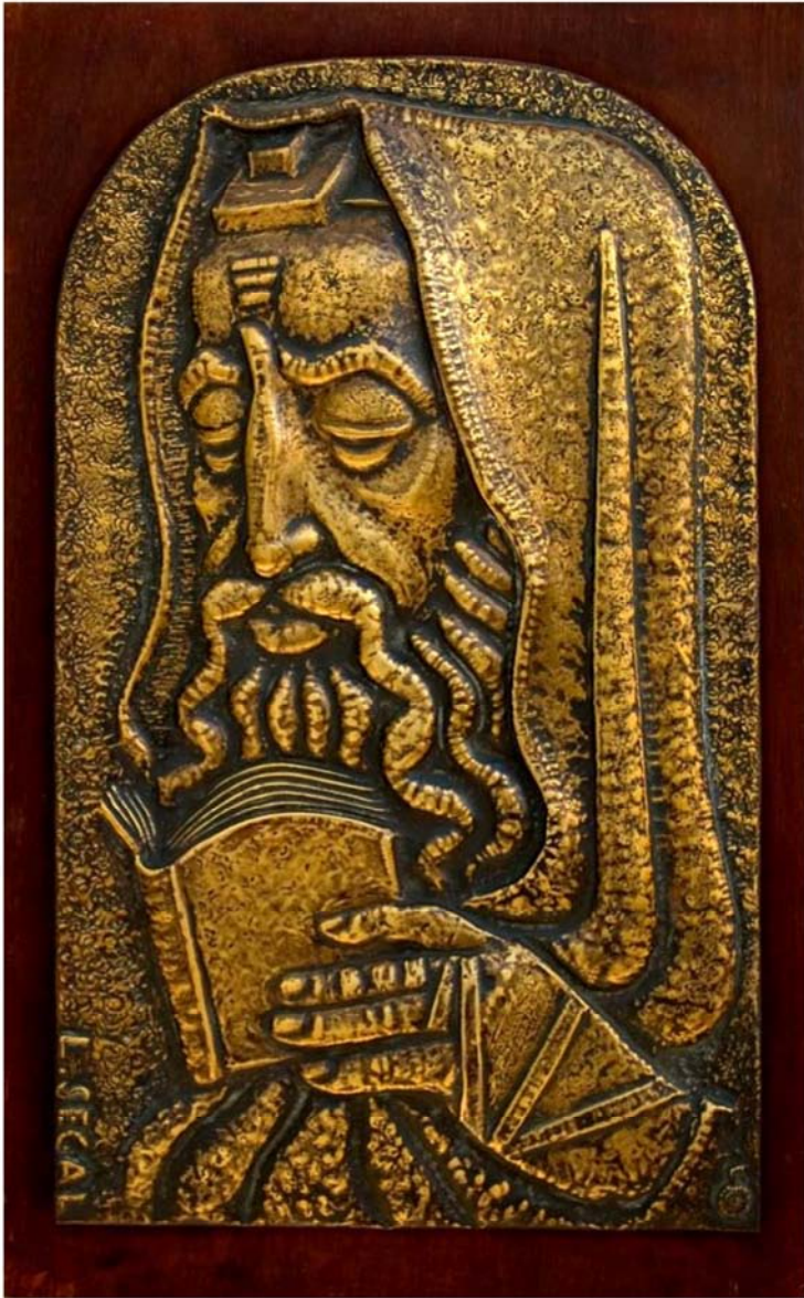
11. Prayer (62x39 cm)