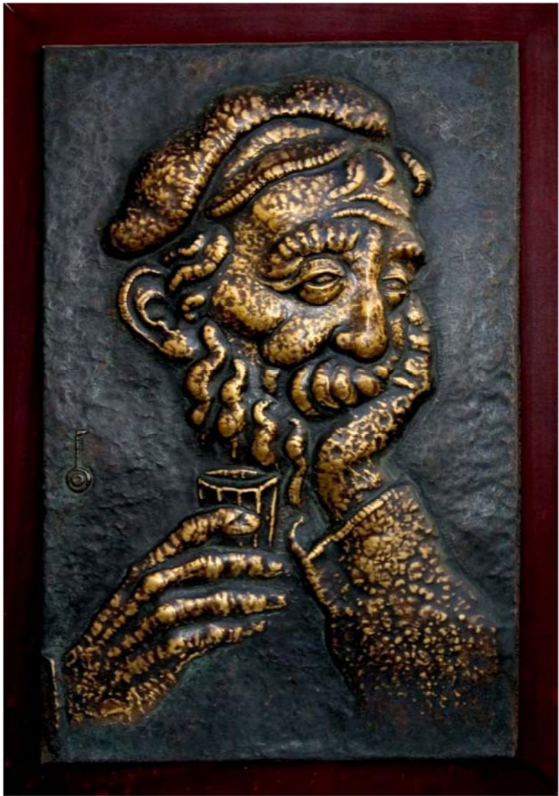
16. L'Chaim (56x39 cm)