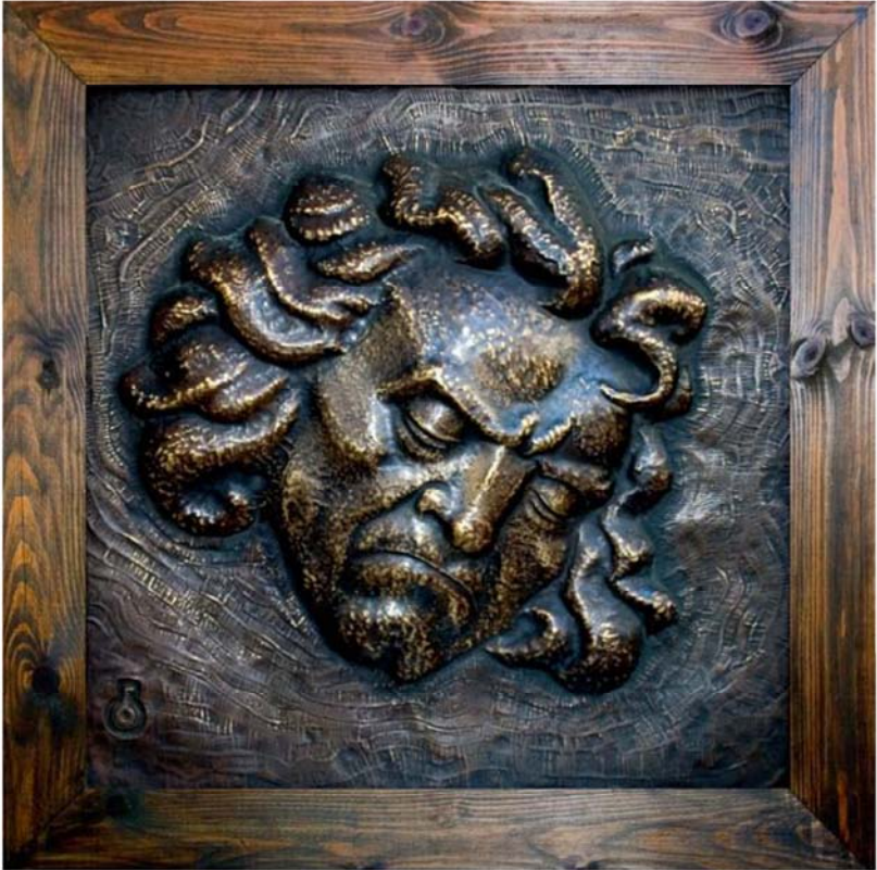
31. Beethoven (67x67 cm)