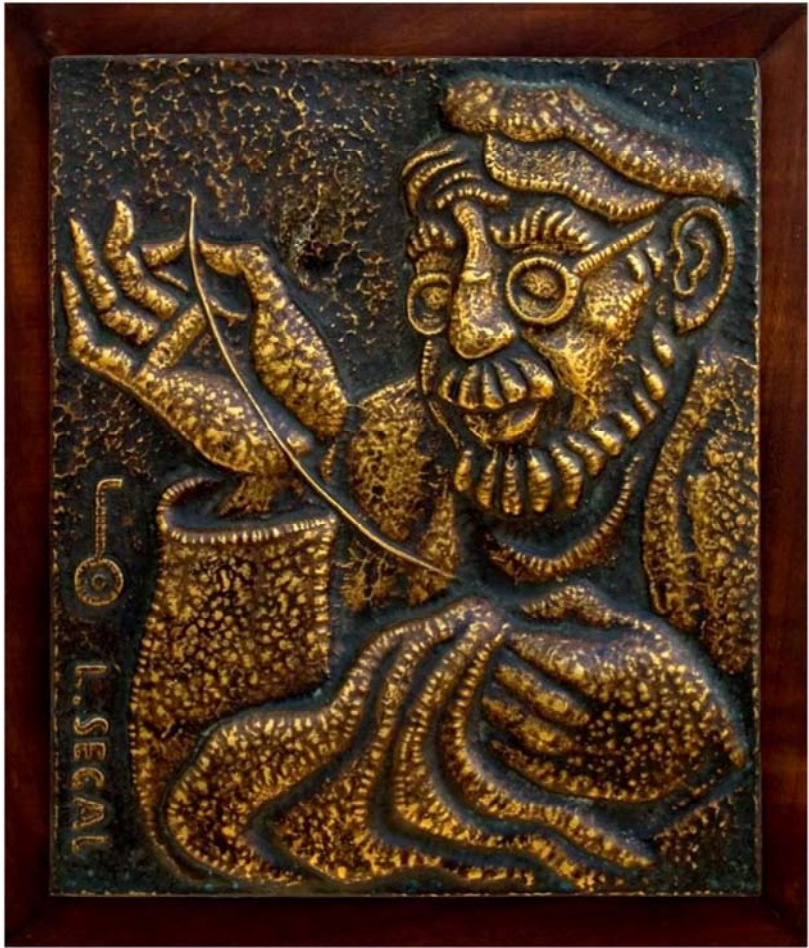
3. Tailor (49x42 cm)