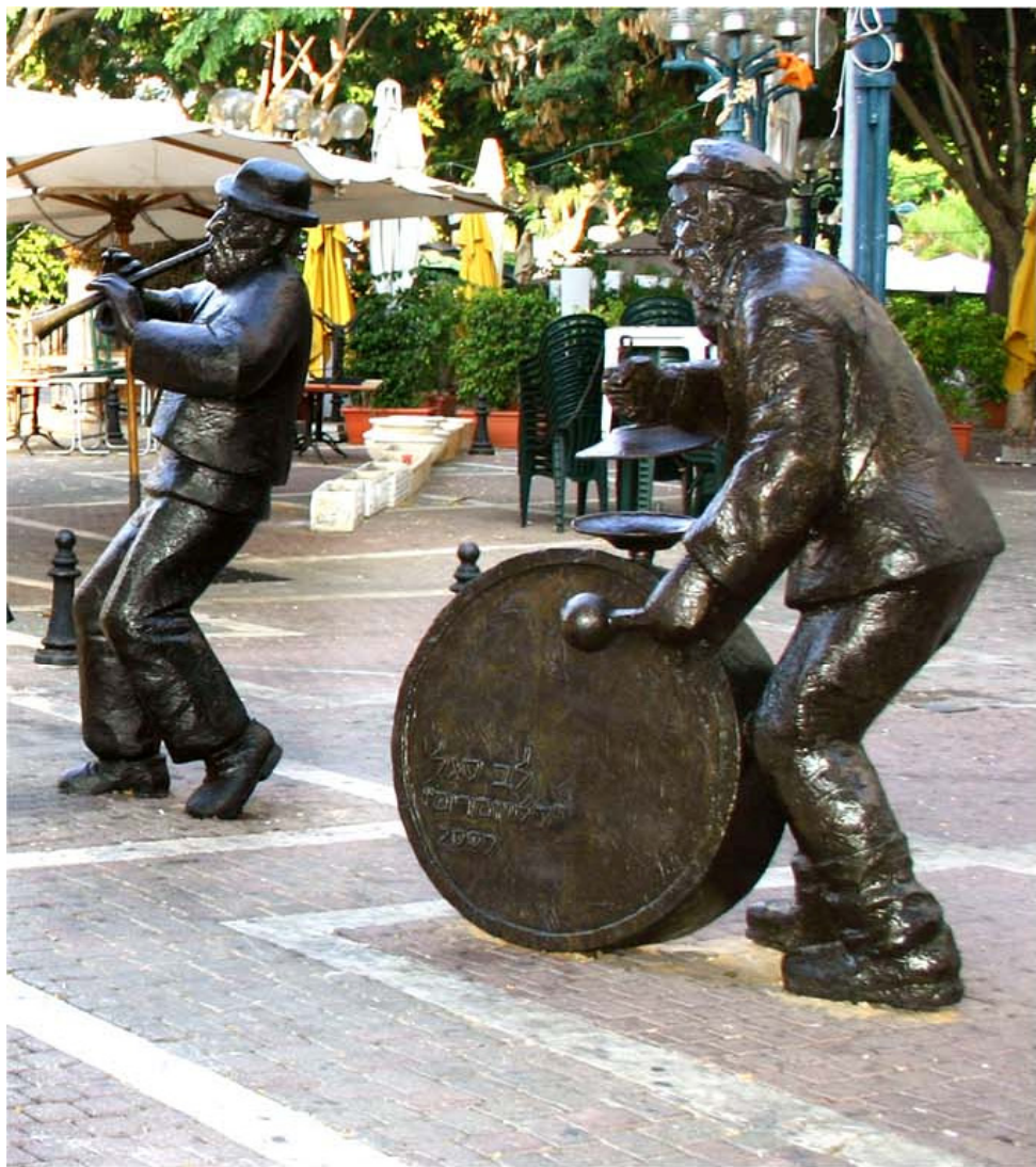
28. 29. Klezmers (Netania)