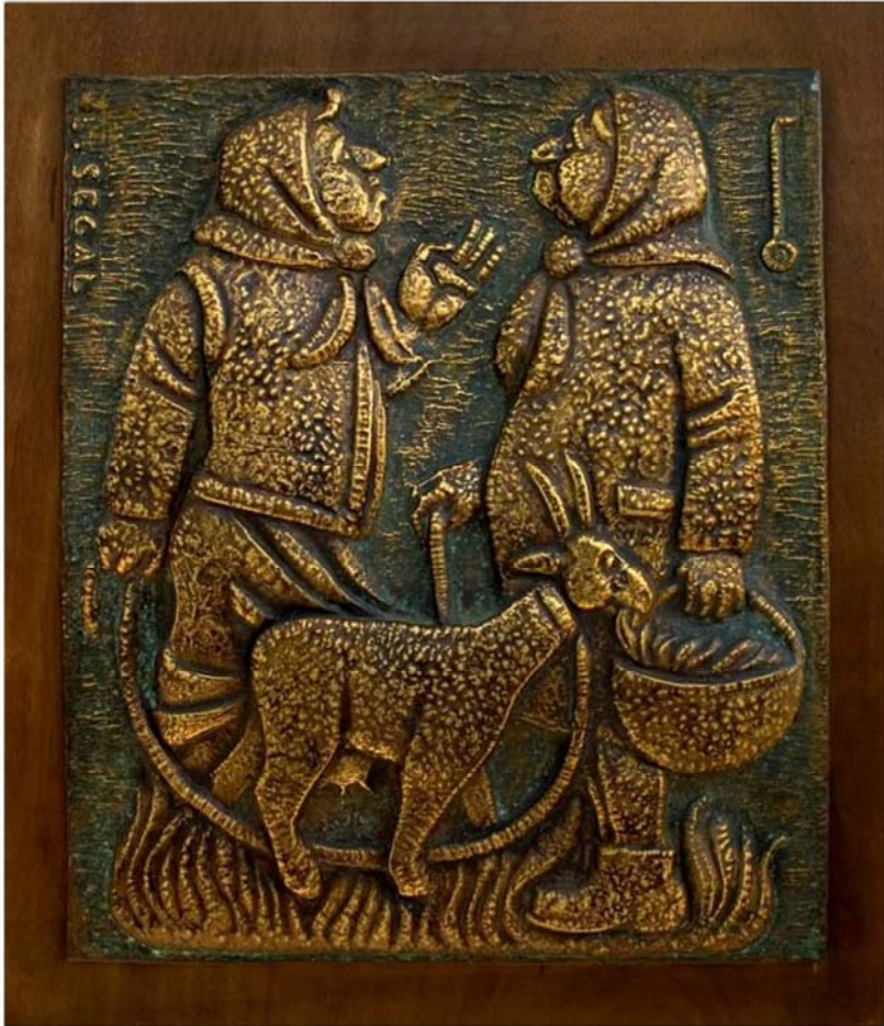
6. Gossip (71x61 cm)