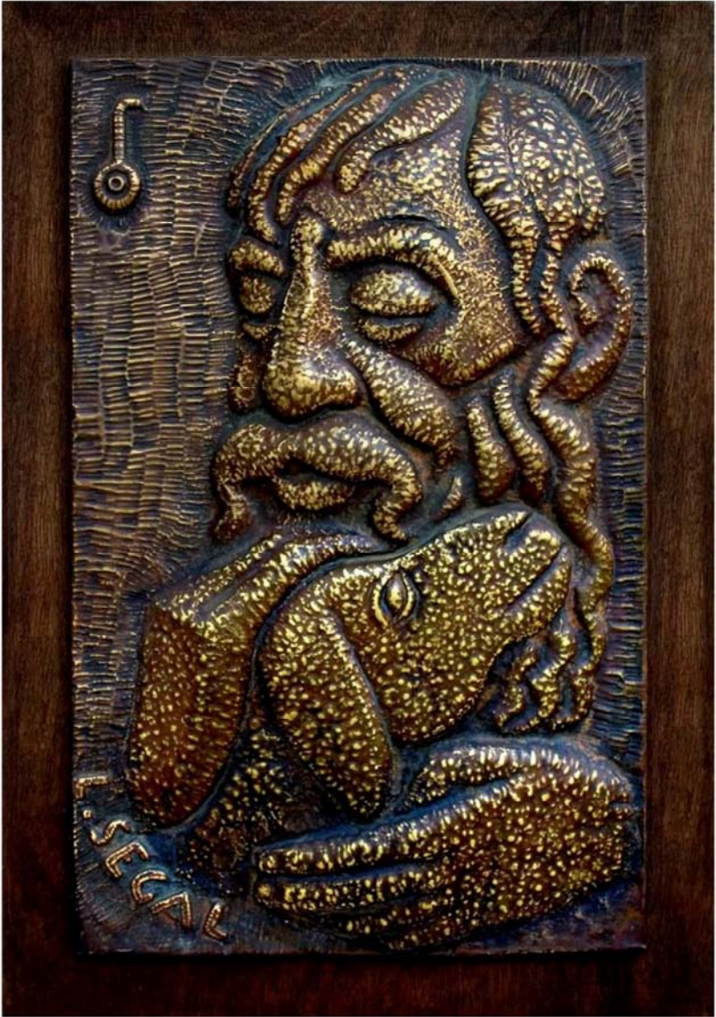
13. Old man with a lamb (63x40 cm)