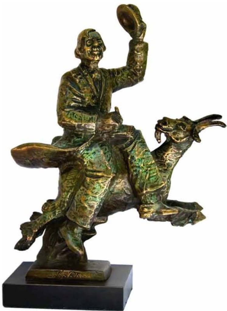
1. Shalom Aleihem (40 cm)