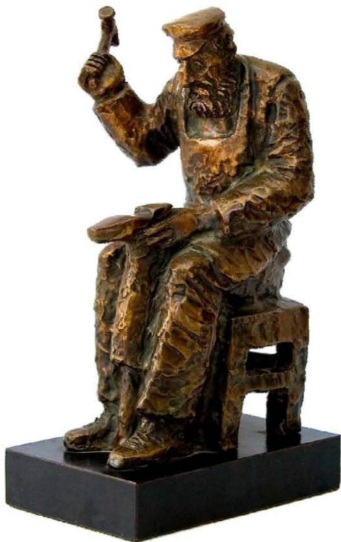
3. Shoemaker (30 cm)