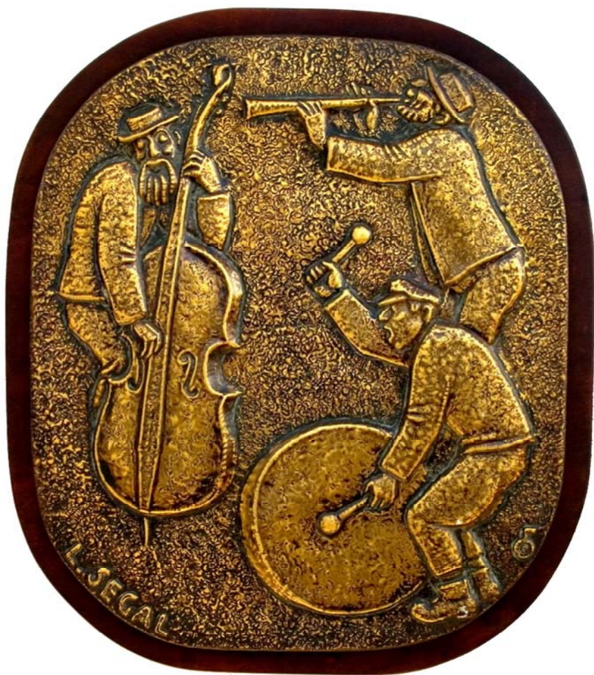
23. Orchestra (52x59 cm)