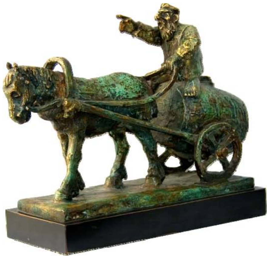
19. Tevyeh (23 cm)