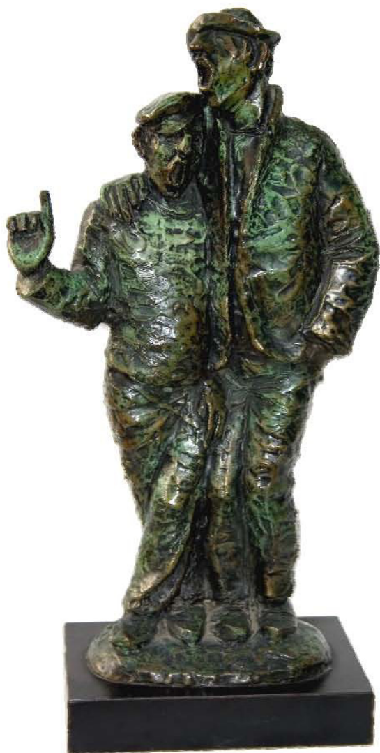
8. Duet (38 cm)