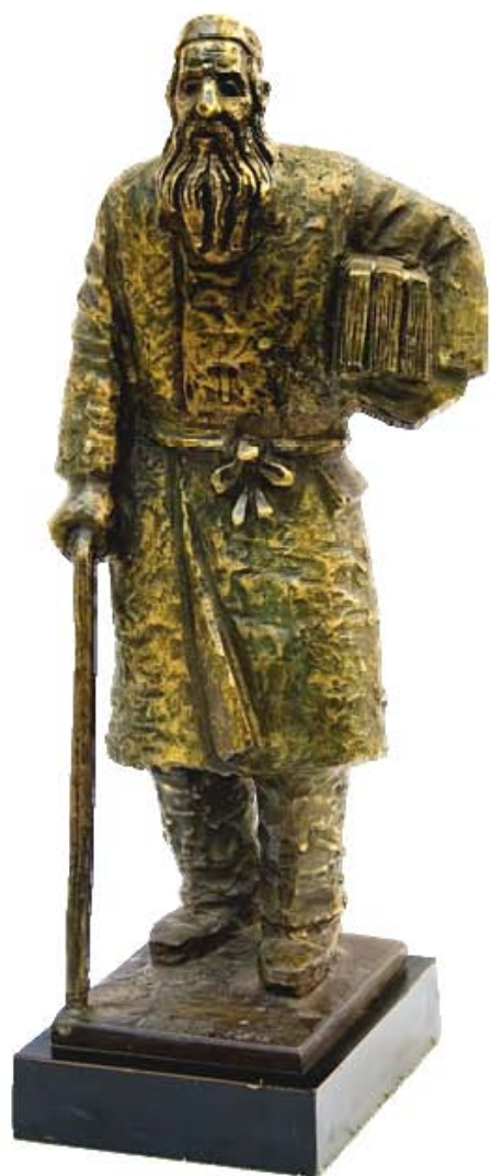
17. Scholar (43 cm)