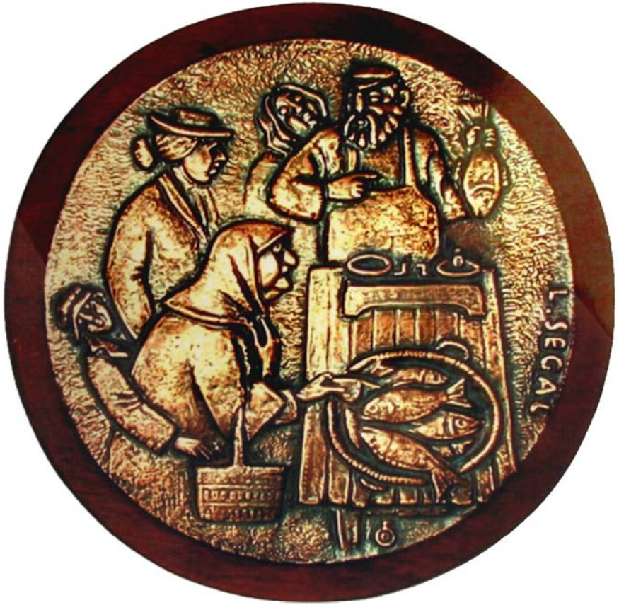
24. Fishmarket (40cm)