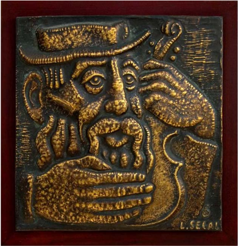
8. Violinist (65x65 cm)