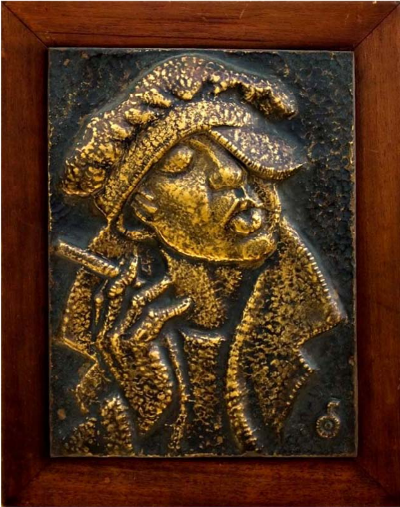
20. Smoker (45x35 cm)