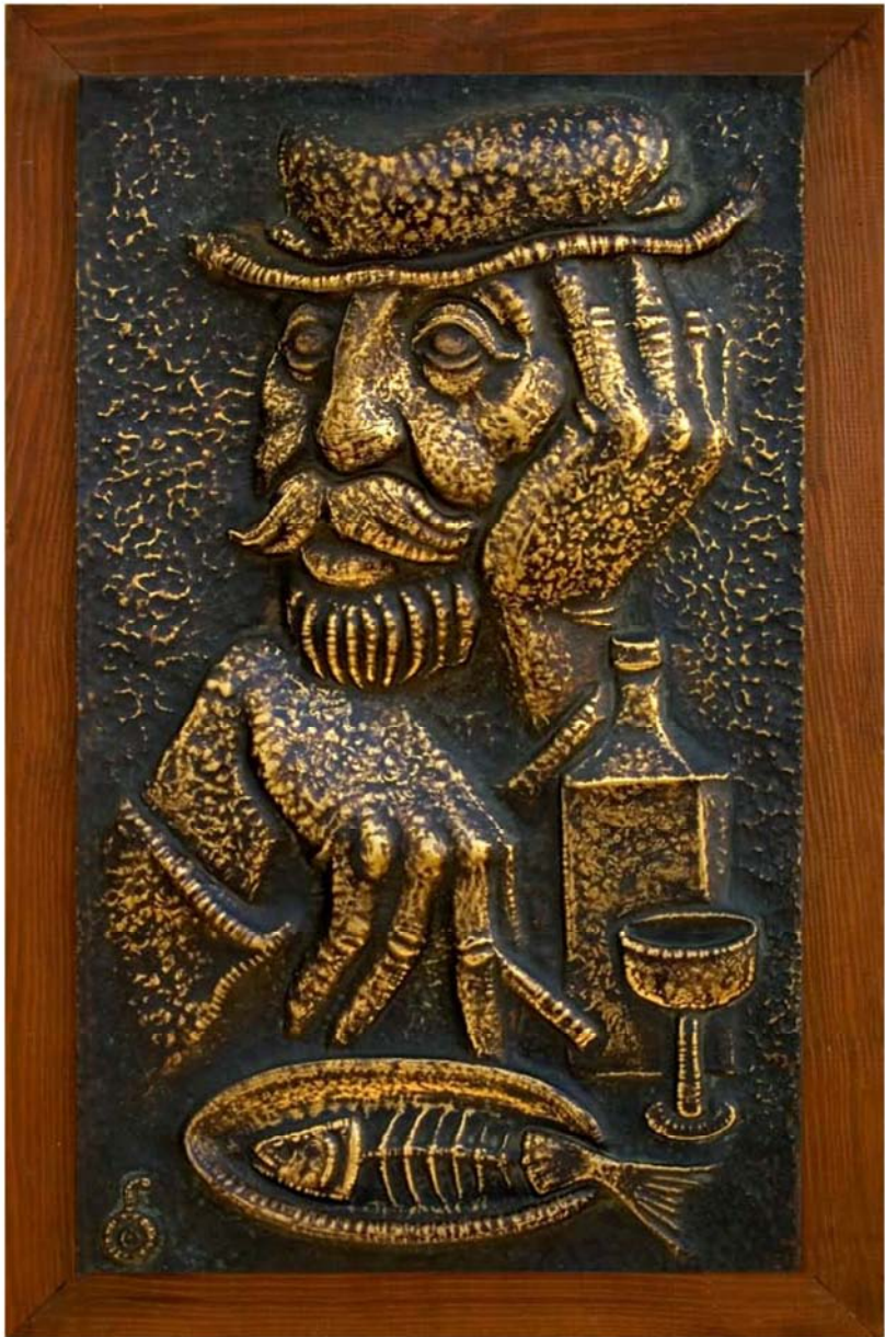
21. Thought (58x37 cm)