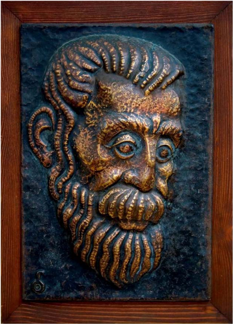
26. Th.Hertzl (36x25 cm)