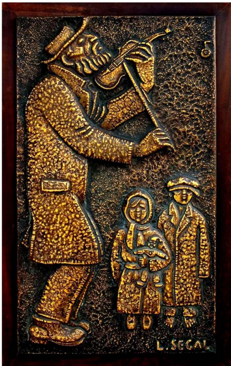
14. Street musician (40x35 cm)