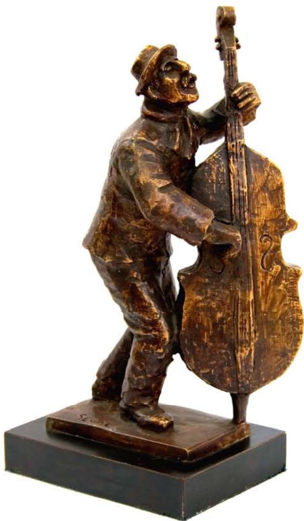
24. Contrabass player (38 cm)