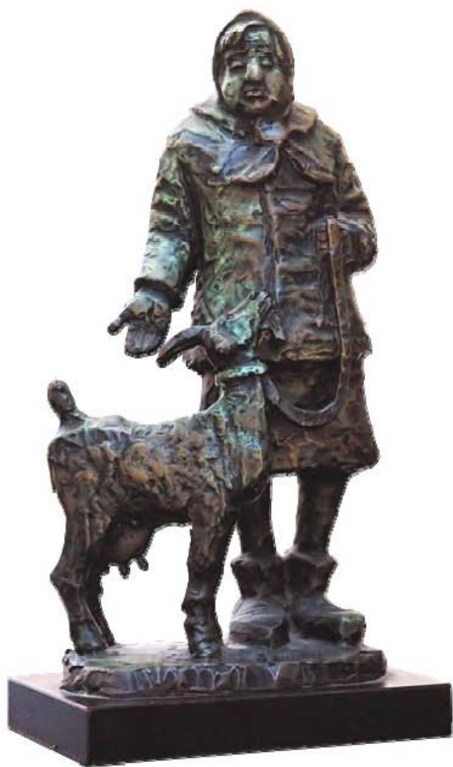
18. Conversation with a goat (40 cm)