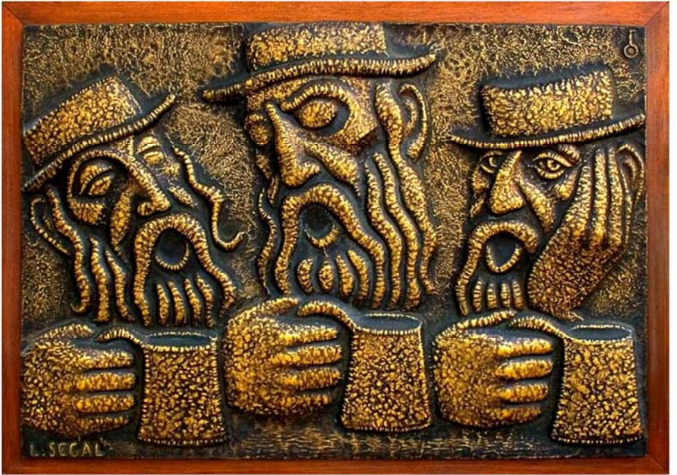
22. Chasidim (62x87 cm)