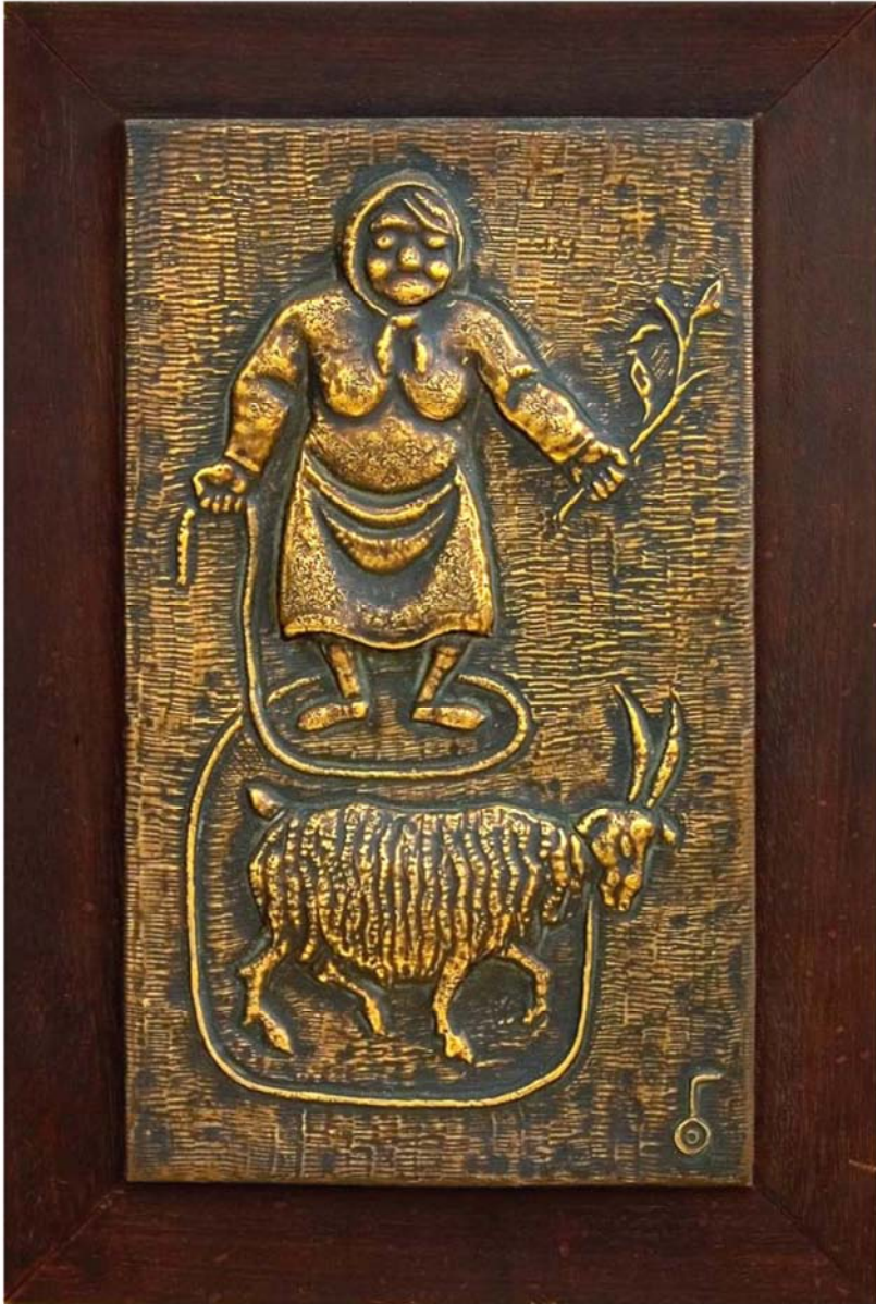
5. Old woman with a goat (41x28)