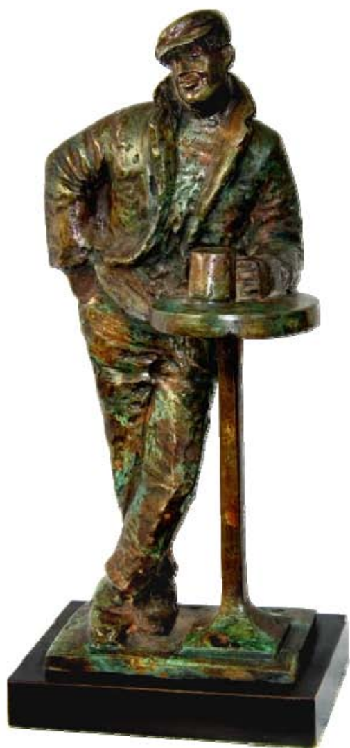
11. In the pub (45 cm)