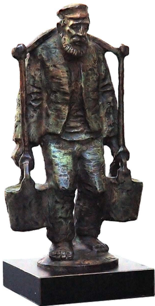
22. Water carrier (32 cm)