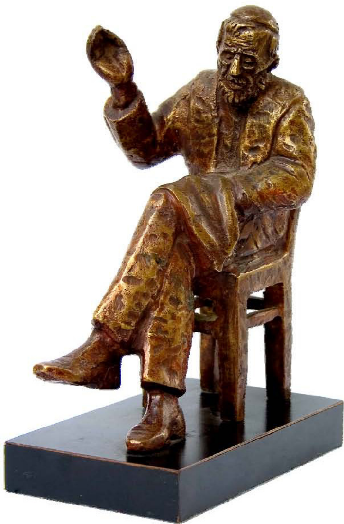
7. Tailor (26 cm)