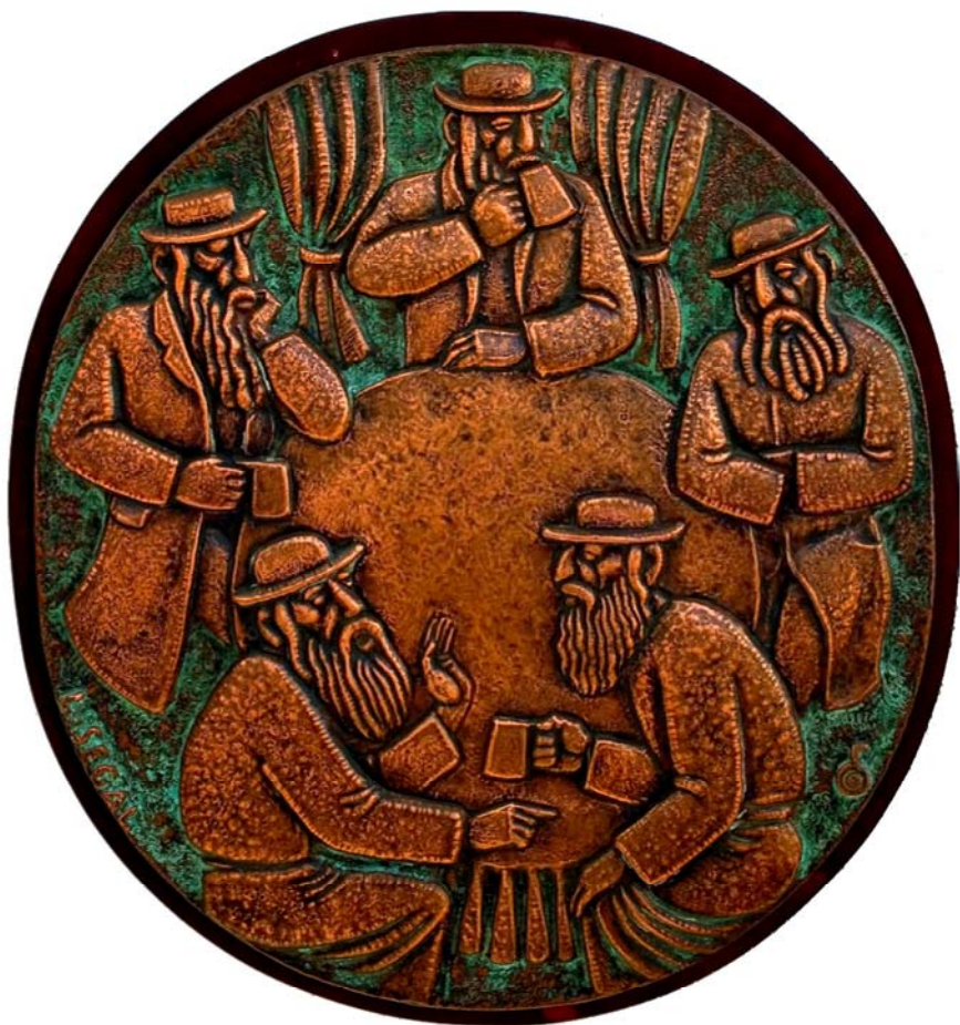
25. Chasidim (60 cm)