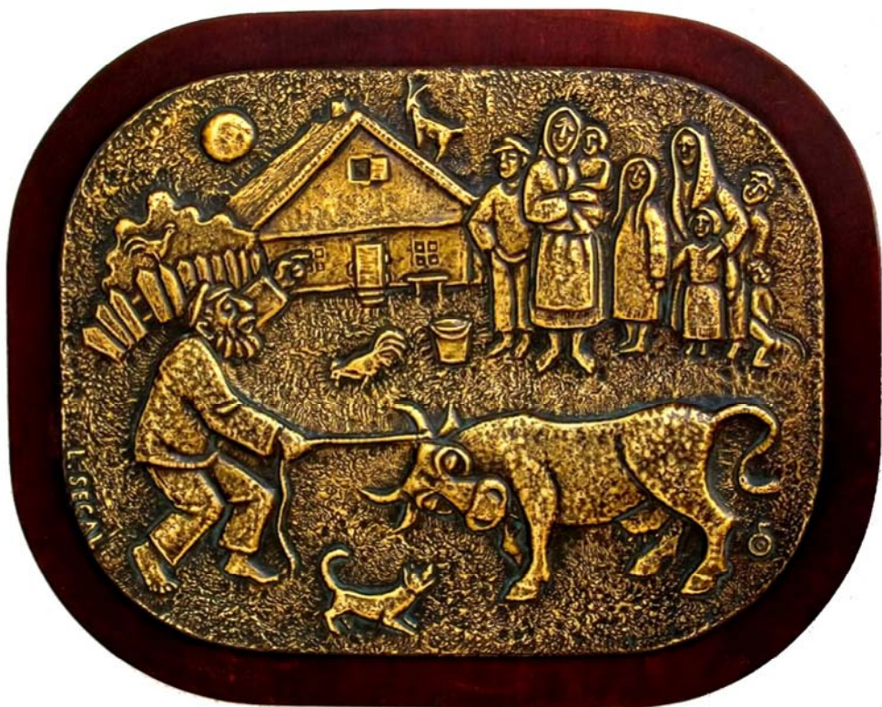
4. Small town (46x57 cm)