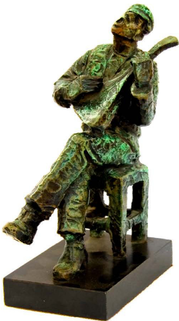
9. Serenade (29 cm)