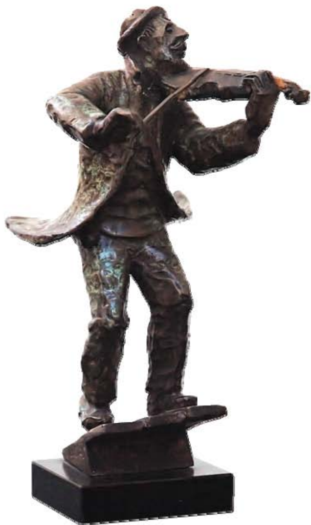
20. Fiddler of the roof (34 cm)