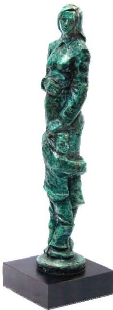
12. Motherhood (47 cm)