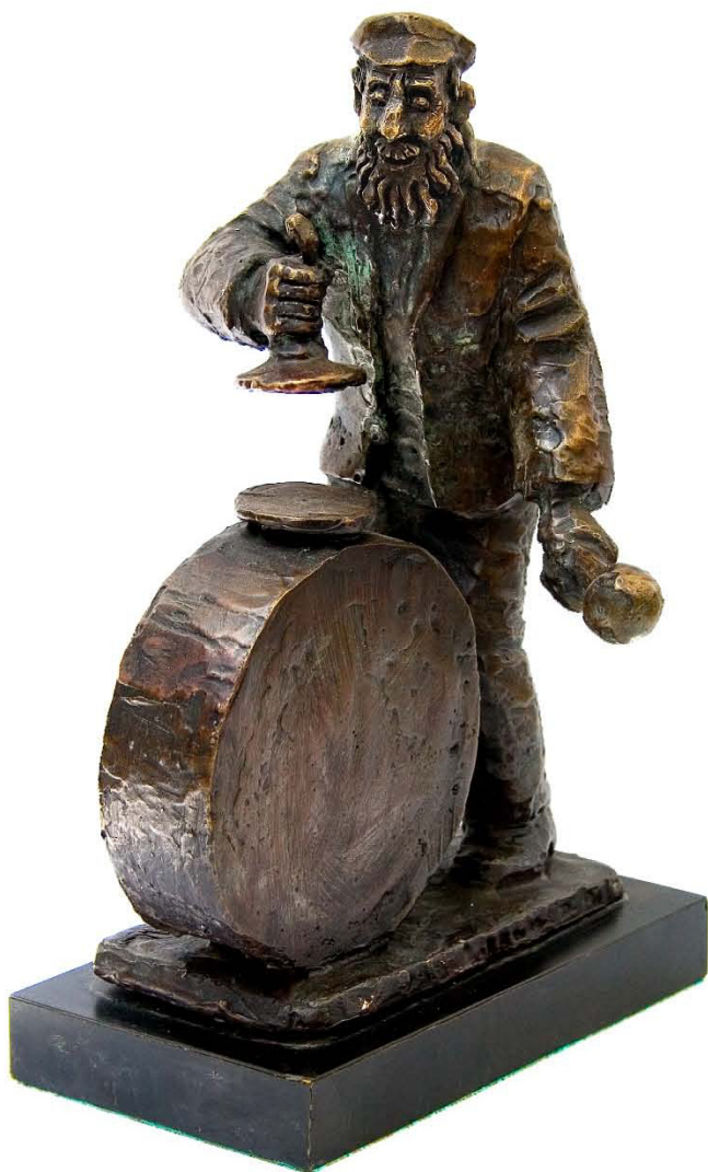
25. Drummer (32 cm)