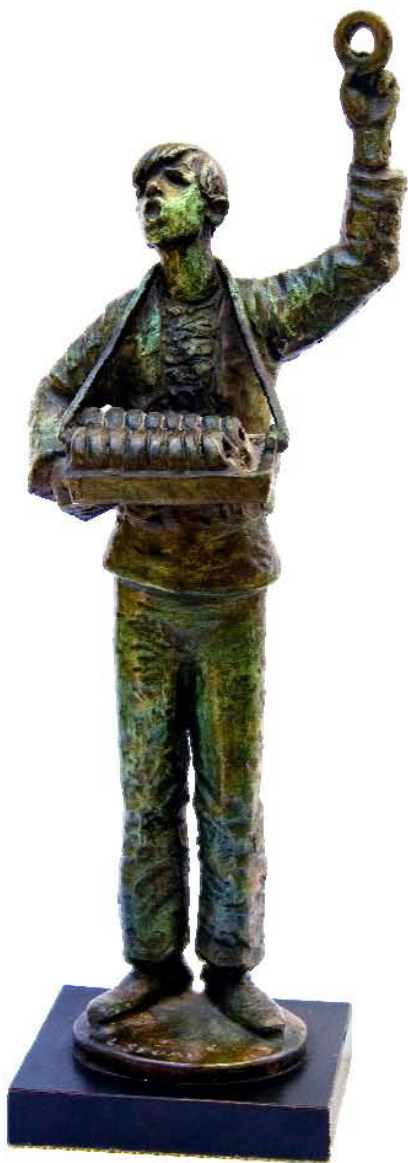
5. Beigel seller (49 cm)