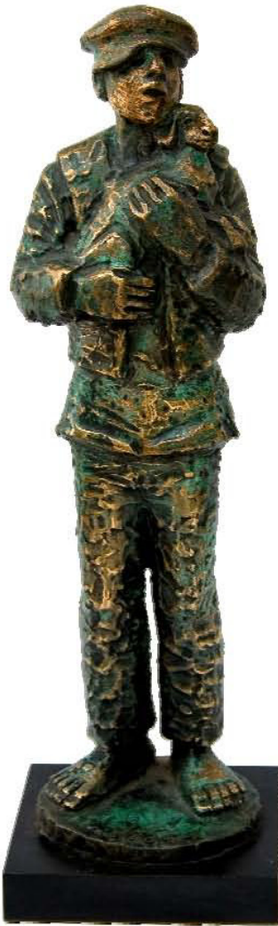
4. Herdboy (49 cm)