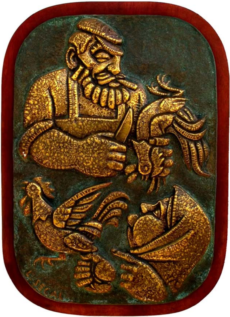
2. Expiatory ritual (70x51 cm)