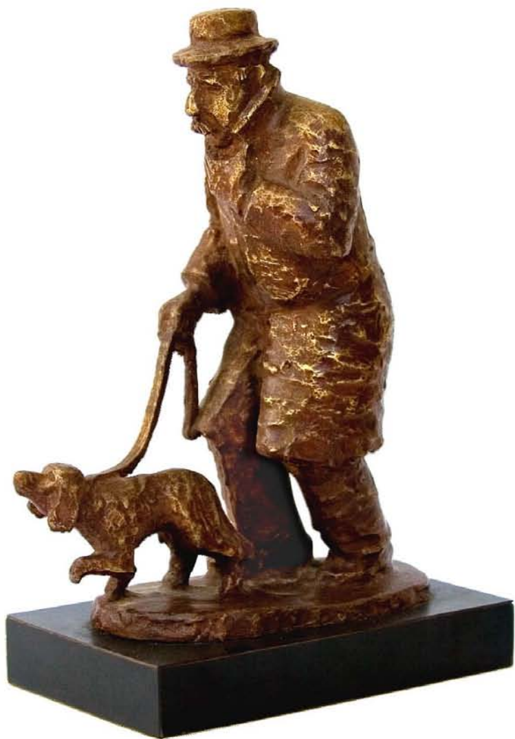
21. Trip (38 cm)