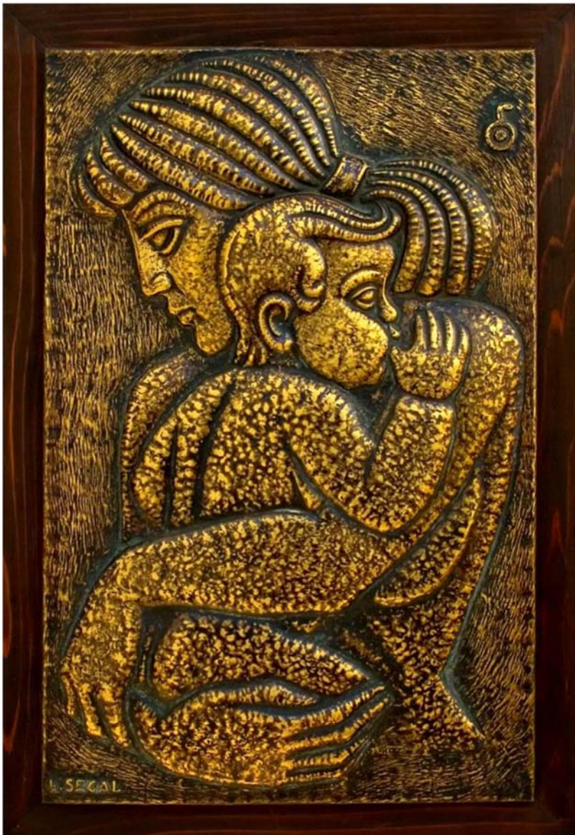
9. Motherhood (64x43 cm)