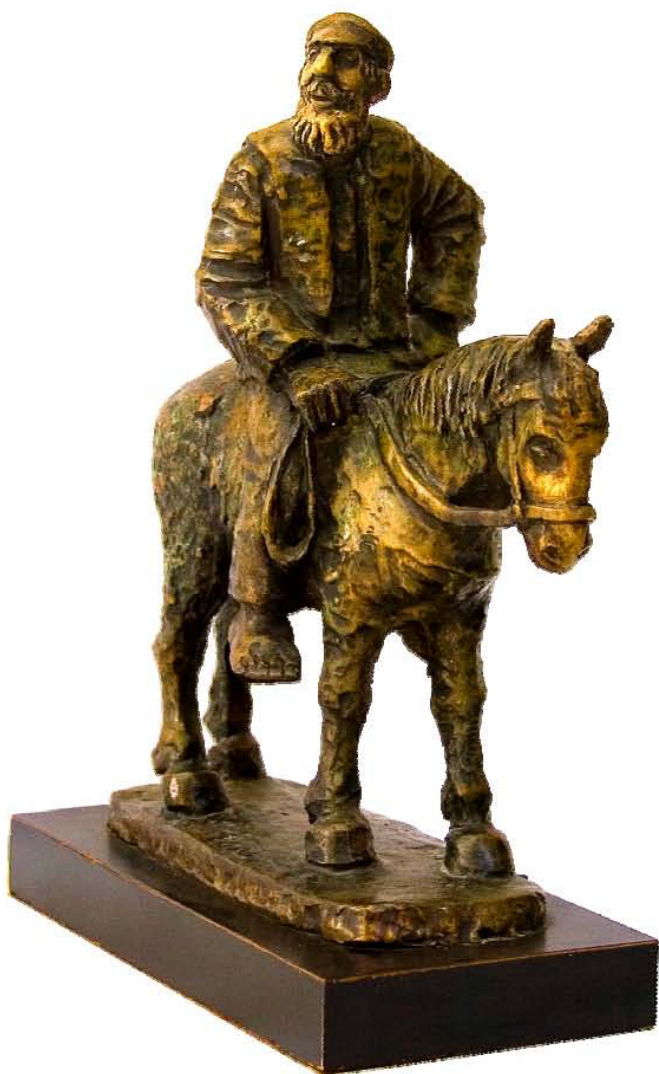
2. Horserider (30 cm)