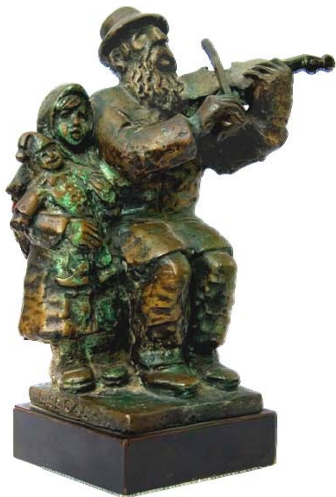
16. Blind Musician (27 cm)