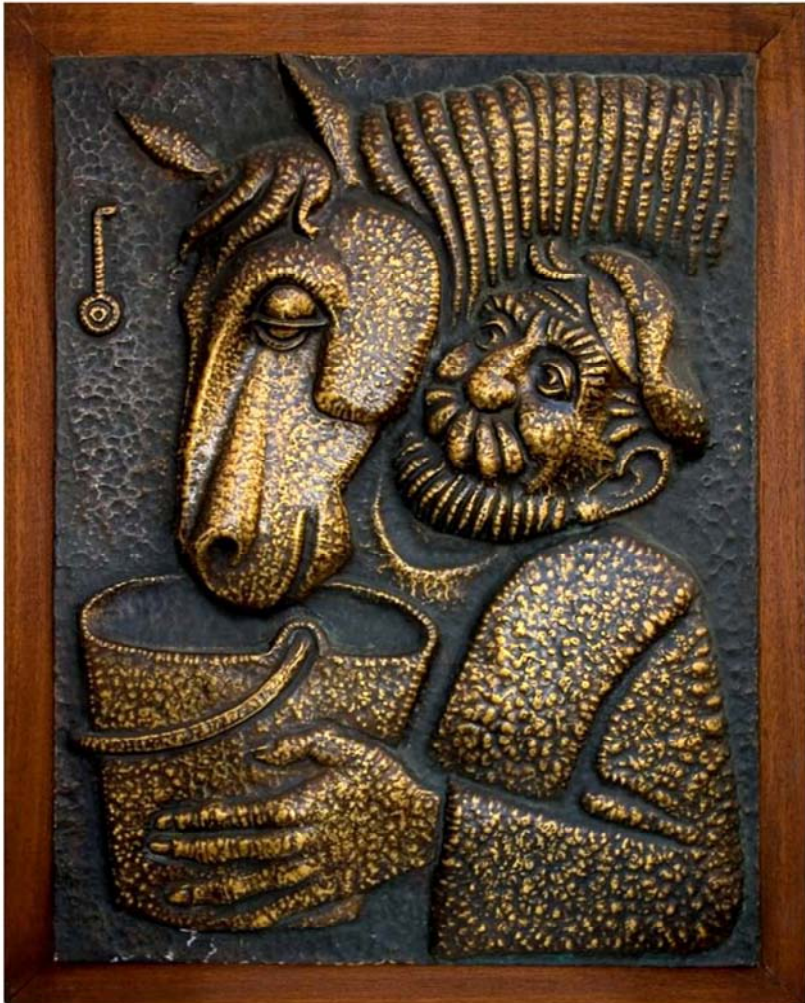
7. Friends (57x72 cm)