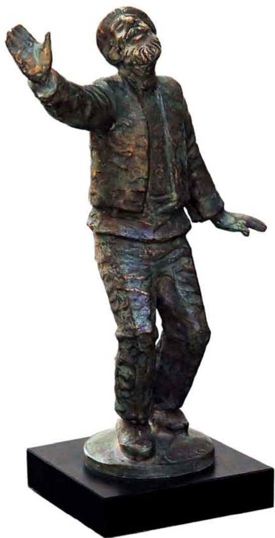
26. Dancer (37 cm)