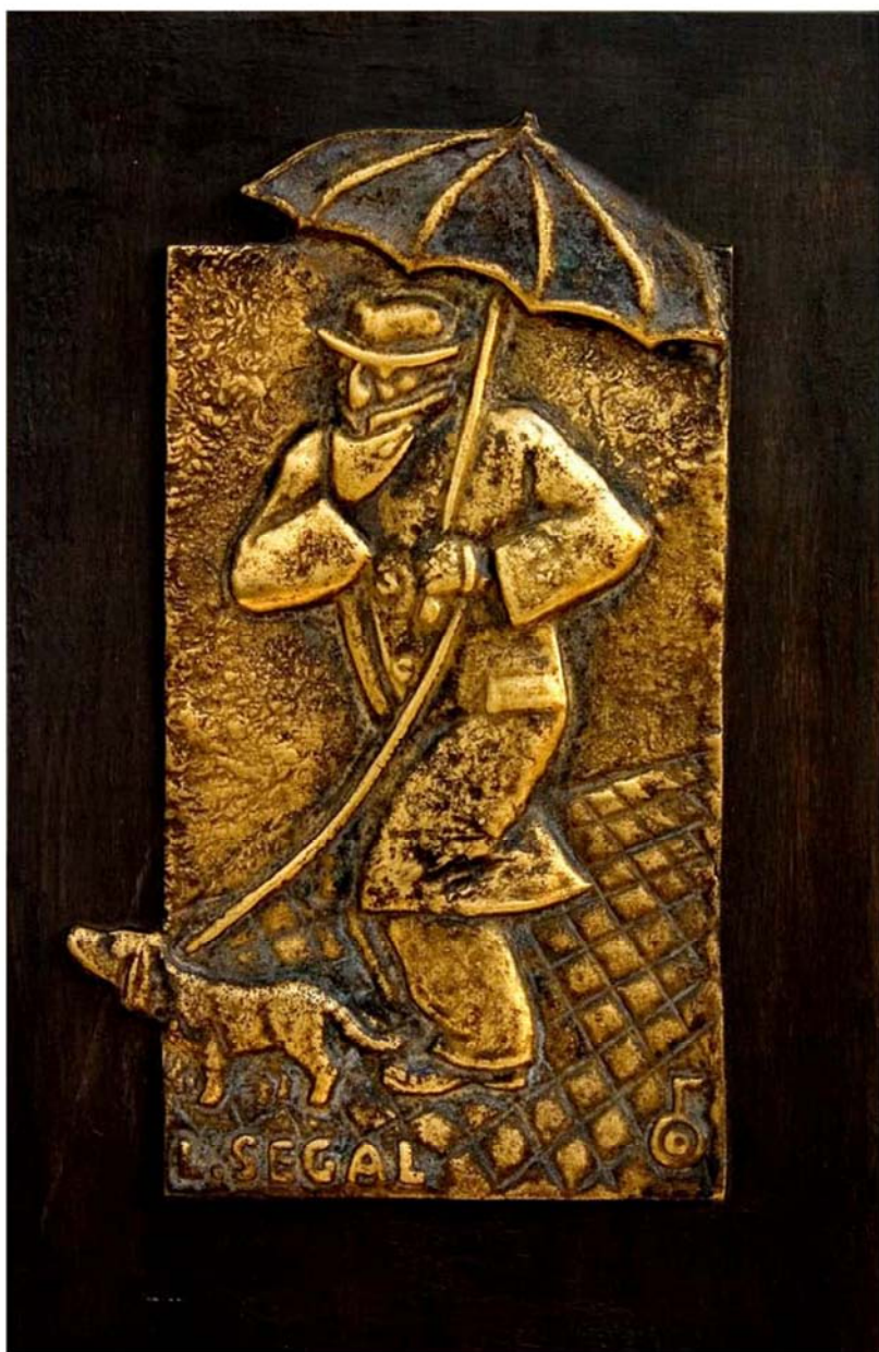
17. Rain (34x23 cm)