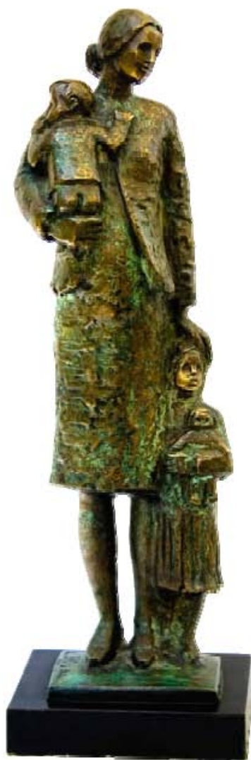
14. Mother (45 cm)