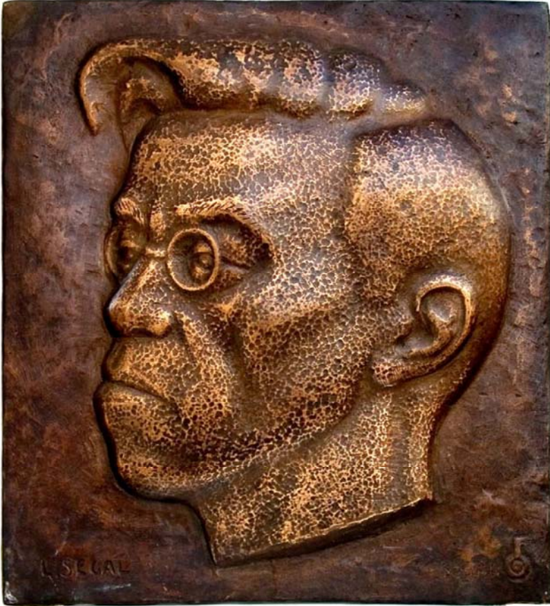
27. Z. Jabotinsky (41x38 cm)